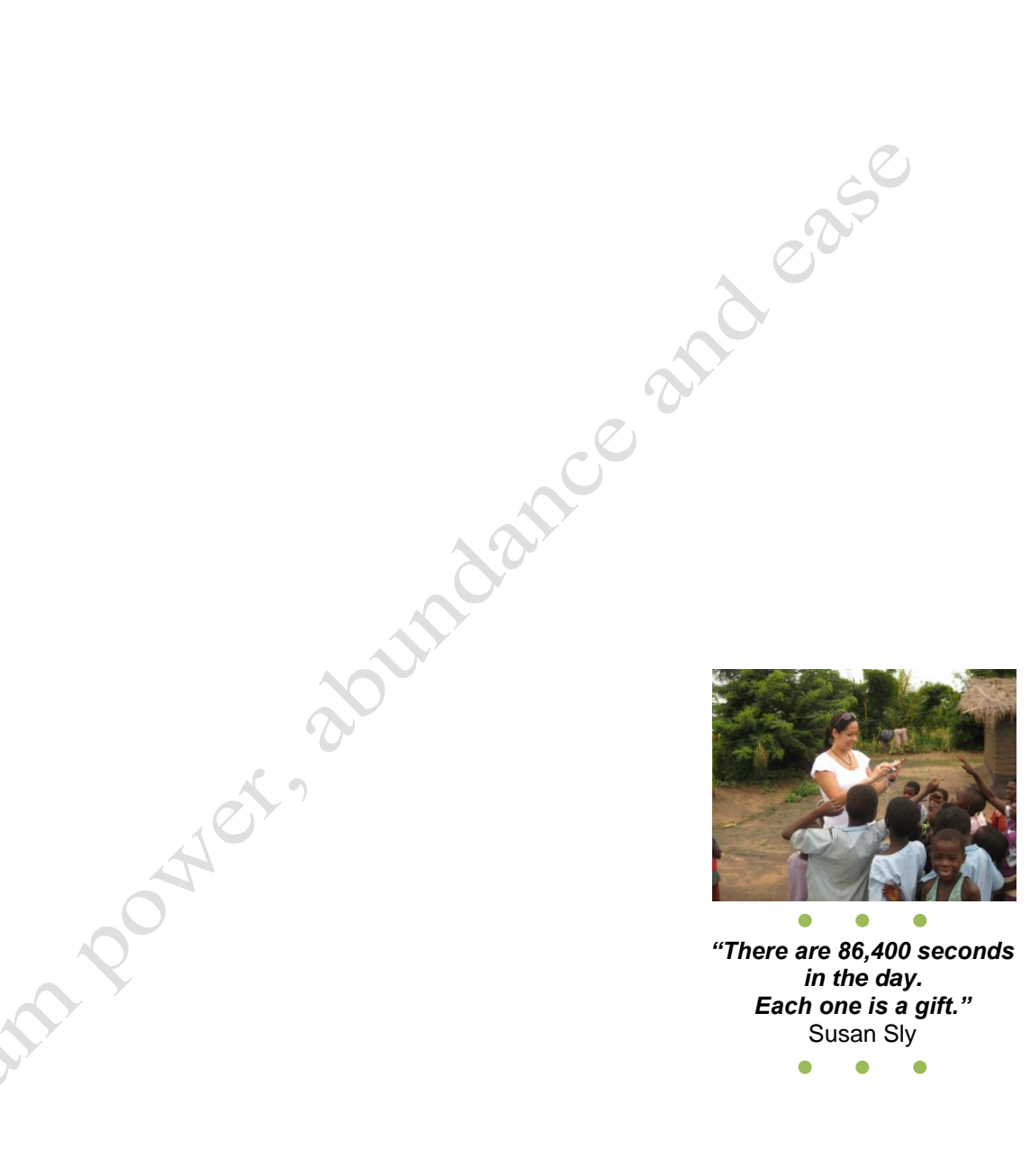
"There are 86,400 seconds Each one is a gift."